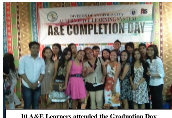
10 A&E Learners attended the Graduation Day