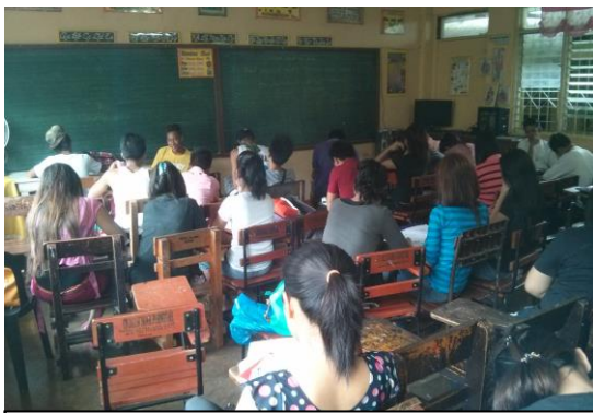
On-going A&E Class Review for the coming test.