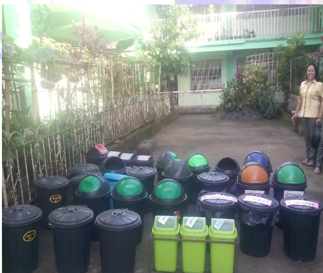
Trashcans in 3 types (bio/non-biodegradable/paper) for proper garbage disposal